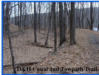
D&H Canal and Towpath Trail