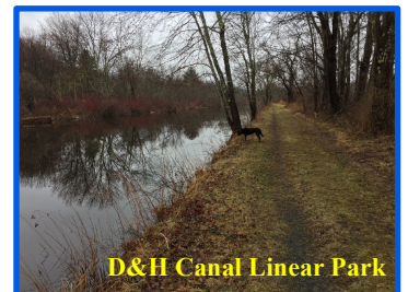
D&H Canal Linear Park

Prepared for: Town of Mamakating Prepared by: HydroQuest and Mid-Hudson Geosciences April 2017